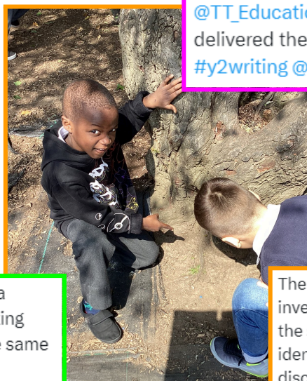
The Year 1 children have been using their investigation skills to explore trees around the school grounds. The children had to identify the different parts of the tree and discuss whether they were evergreen or deciduous trees. Great work Year 1!