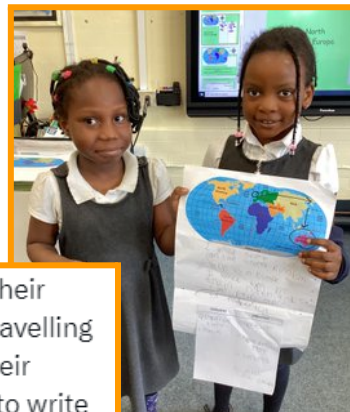
Year 1 really enjoyed planning out their own route starting in Europe and travelling to another continent. They used their knowledge of the compass points to write a route and then compared similarities and differences of the two continents. @thrivetrust_UK #Year1Geography